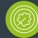
Building environmental certification