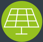
PV ready roofs

From the very beginning of the construction process, we provide in our facilities: Market-leading environmentally friendly solutions, including: