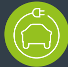
Electric vehicle chargers