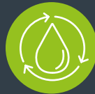
Rainwater recycling/ retention system