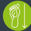
Minimizing your carbon footprint